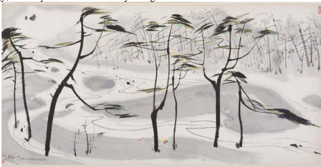
Fig. 2 Painting by Wu GuanZhong “The sauce and pickle shop”

With the gradual development of The Times, the international communication is increasingly enhanced, and more importantly, the collision and integration of language and language. Watercolor art is also inseparable from the impact of this objective environment, the east and west watercolor art in the mutual exchange of rapid development. In particular, in recent years, with the increasingly frequent and close international cultural exchanges, the development of watercolor culture between the east and the west has become increasingly prosperous. Painters have more and more opportunities to communicate abroad, and their vision is more and more broad. In the communication, painters of water-based materials from different countries have promoted the improvement of painting technology, and they have also constantly brought forth new ideas.